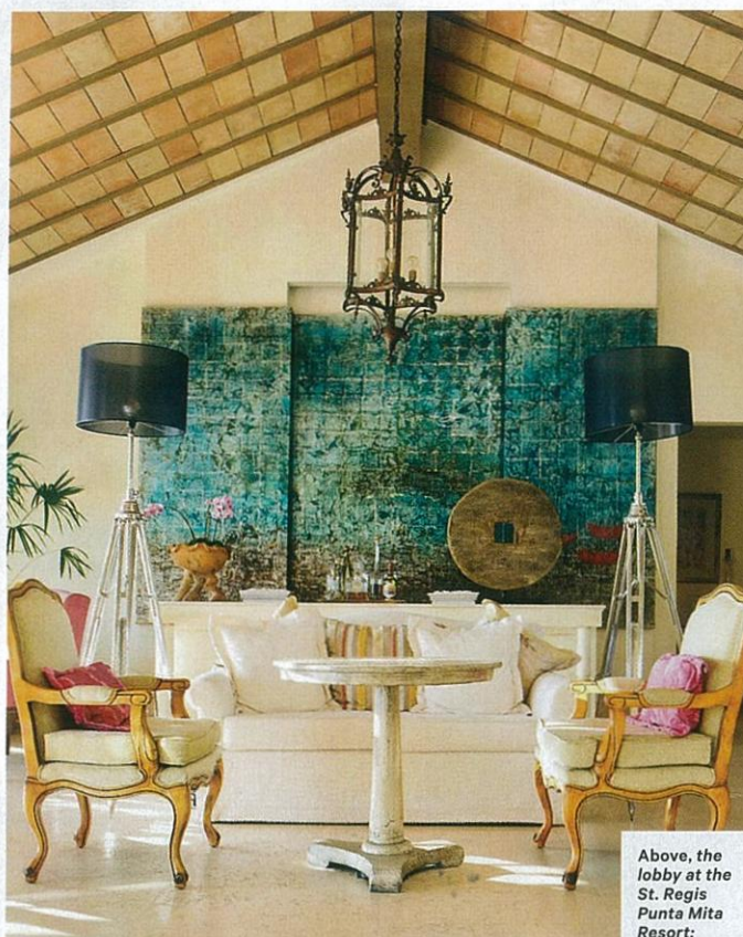
Above, the lobby at the St. Regis Punta Mita Resort; below, Ama Estancia's midcentury-inspired main house.

While most Cabo resorts have reopened after Hurricane Odile's damage—and some, like One&Only Palmilla (rooms from $455; Carretera Transpeninsular, km. 7.5; 866-829-2977; pamilla.oneandonlyresorts.com) and Esperanza (rooms from $500; Carretera Transpeninsular, km. 7, Manzana 10; 866-311-2226; esperanzaresort.com), with major face-lifts—it's the less-developed Punta Mita that has emerged as the new Mexican enclave. West Coasters who don't want to travel as far as Hawaii