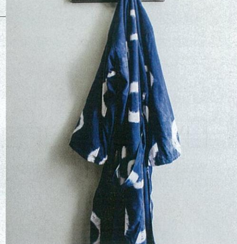
Bold prints (left) and a shibori robe hang in a guest room at The Buchanan.

1. Benkyodo serves fresh mochi out of a nondescript glass-and-brick storefront. Get the chofu , a plain sweet mochi wrapped in a pancake and stamped with Japanese characters.