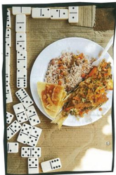
Local favorites at Pelican Bar. Opposite (clockwise from top left): A roadside conch stand, beach essentials, Montego Bay craft market finds, and a Pelican Bar water taxi.

The more you do in Jamaica, the less you want to do. The "ya, mon" spirit makes you kick back like that. There's no place better to accomplish very little than at 30-acre Round Hill Hotel and Villas, home base for the end of our trip and a longtime haven for the jet set and the beautiful. Oscar Hammerstein was Villa 12's original owner and worked on The Sound of Music there. Paul McCartney takes Villa 17 and a handful of others for his family holidays. Heidi Klum is practically a fixture on the beach. A decade ago, Ralph Lauren remodeled the 36-room hotel with an eye toward preserving the cottage colony vibe, and today it feels like a tropical village—for the very, very important. Though it would be impolite to name names, we share the view on our last morning at breakfast with a world-renowned architect, an Oscar-winning director, and one of the Caribbean's most distinguished families. It's easy to imagine a certain British Secret Intelligence Service agent fitting right in.