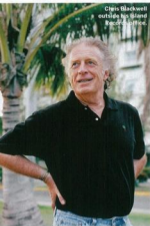
Chris Blackwell outside his Island Resort offices.

British music producer Chris Blackwell helped turn performers such as Bob Marley and U2 into worldwide sensations. At 77 and retired from showbiz, he's building a legacy in Jamaican tourism with his boutique resorts. Here's what makes his heart sing about his adopted paradise.