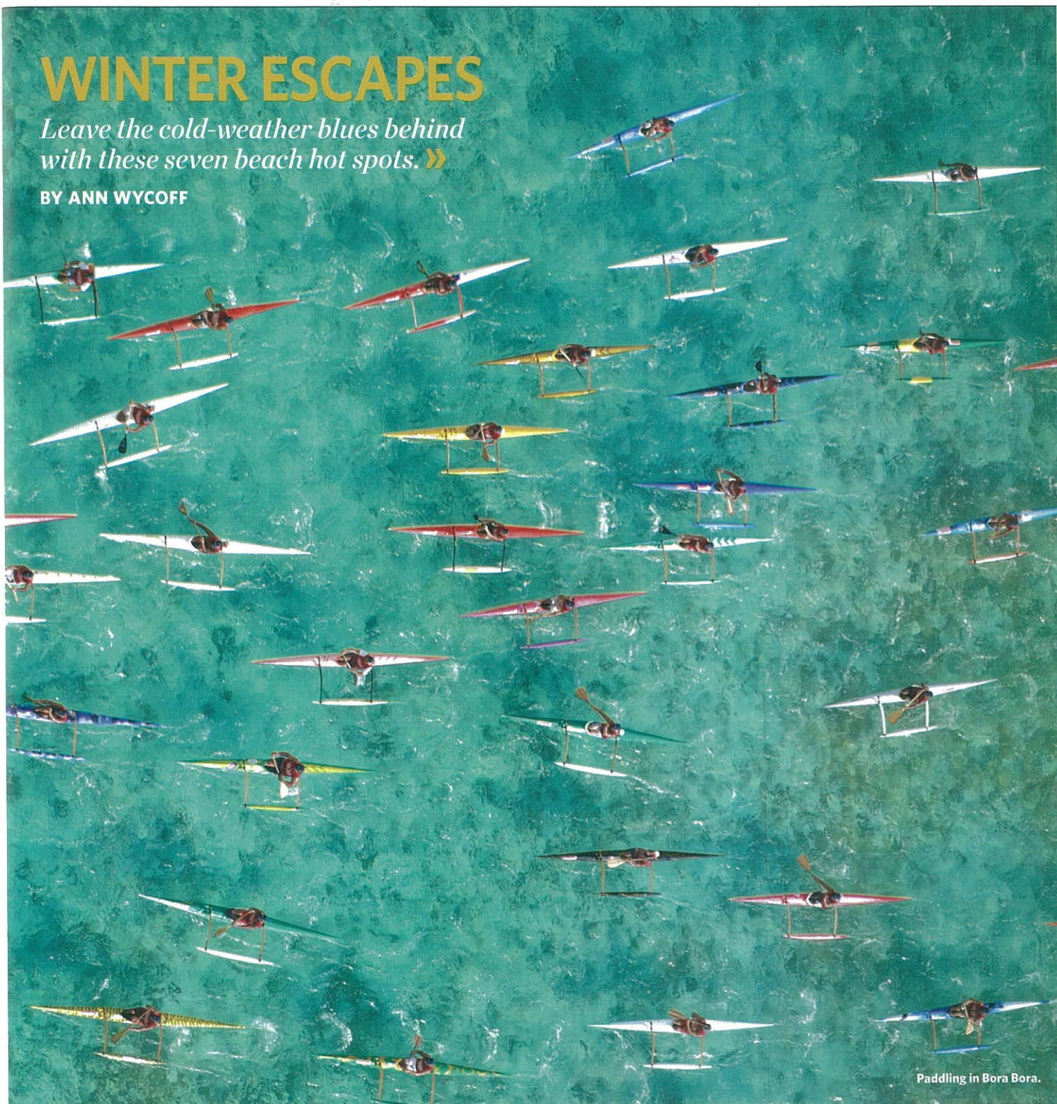
Paddling in Bora Bora.