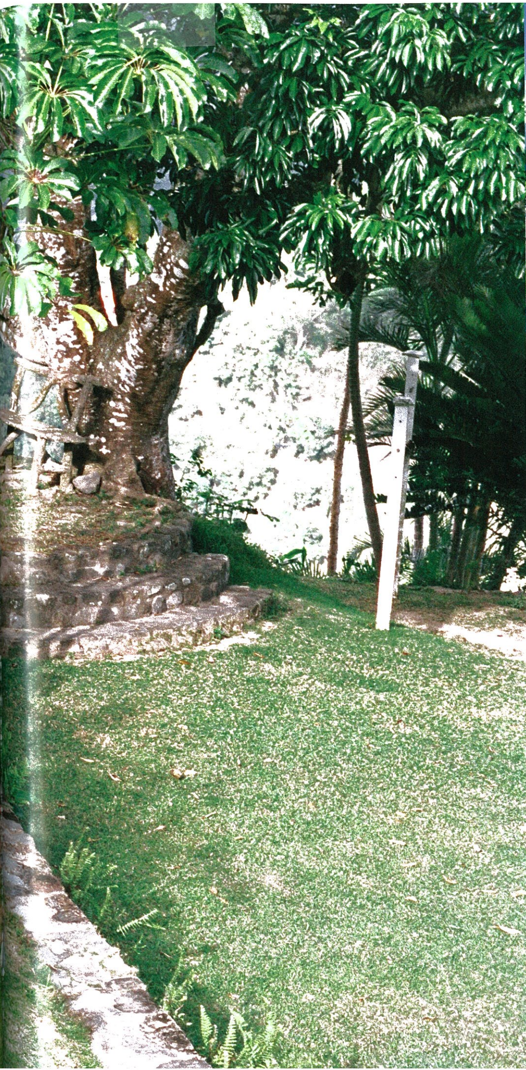
Strawberry Hill resort