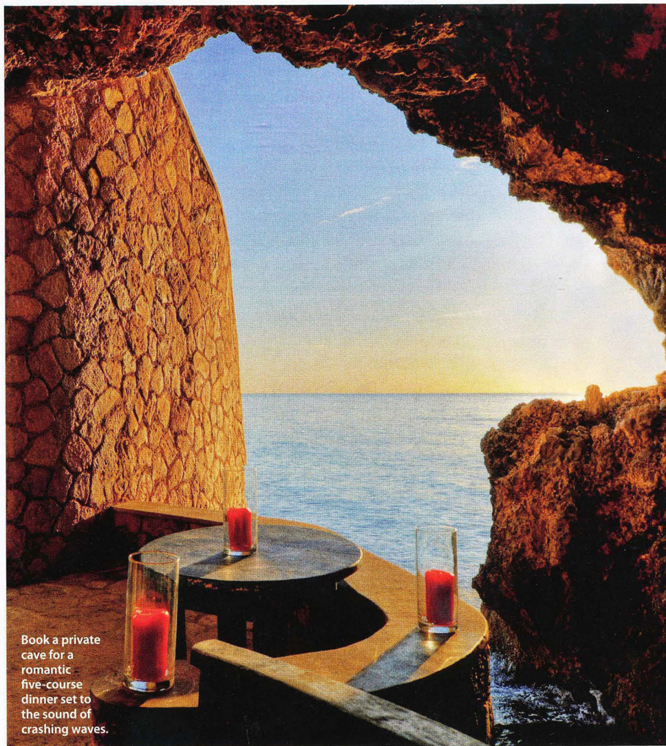
Book a private cave for a romantic five-course dinner set to the sound of crashing waves.

RATES start at $445; 800/688-7678 or islandoutpost.com .